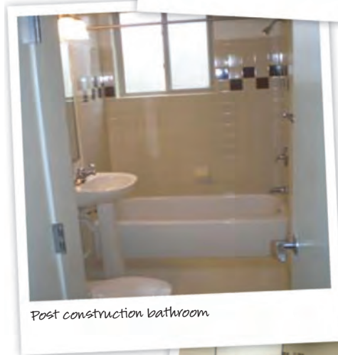
Post construction bathroom