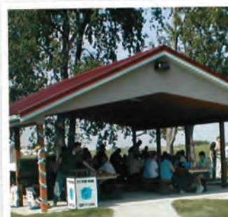
Viking Terrace's New Picnic Shelter

Not all the projects started out with green in mind. Viking Terrace had considered some energy efficiency improvements during its renovation planning, such as geothermal heating and cooling, but could not get the necessary financing. Were it not for an intervention by Enterprise Community Partners they would not have been able to "go green" due to the increased costs associated with green building.